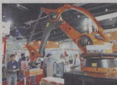
ProPak Asia 2017 will showcase technologies in various industries.