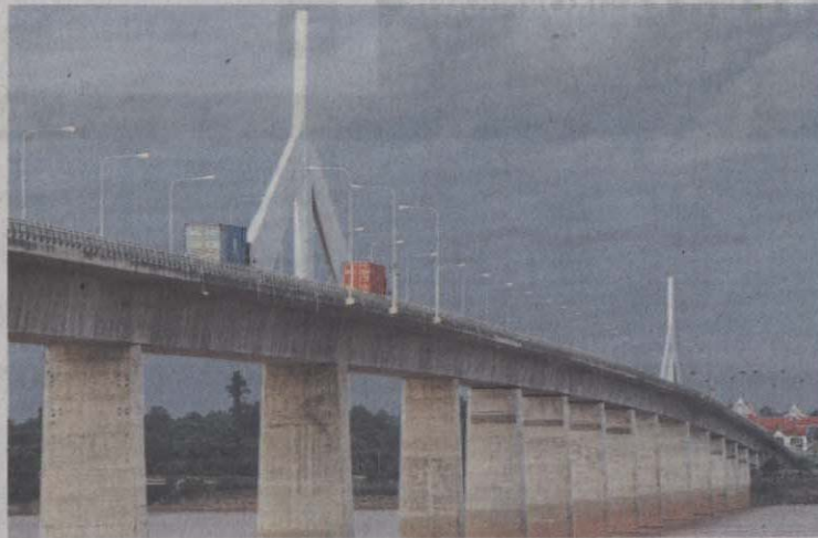
Container trucks move across the Second Thai-Lao Friendship Bridge connecting Mukdahan in Thailand with Savannakhet in Laos.